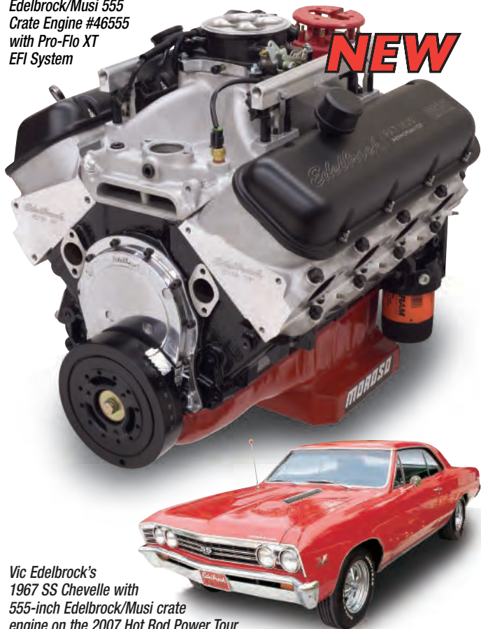
Vic Edelbrock's 1967 SS Chevelle with 555-inch Edelbrock/Musi crate engine on the 2007 Hot Rod Power Tour