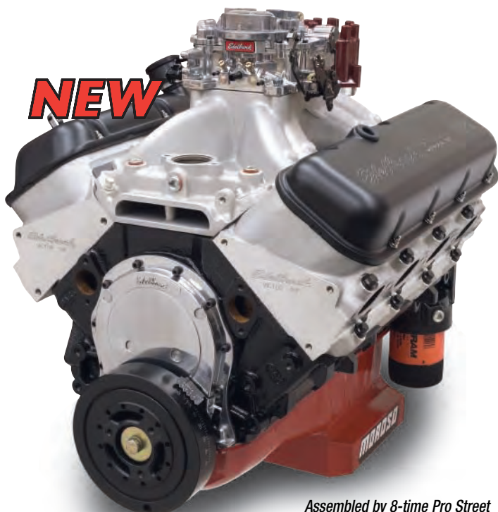
Assembled by 8-time Pro Street World Champ Pat Musi, this Chevy starts with a new Dart Big M block