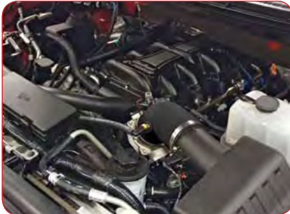
E-Force Supercharger Kit #1583 for 2009-10 F-150