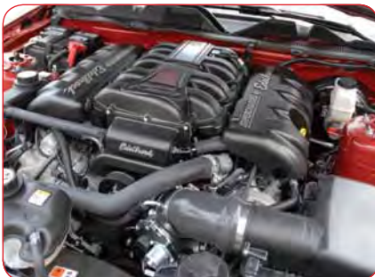
E-Force Supercharger Kit #1582 for 2010 Mustang

E-Force Competition Supercharger Kit (for 2010 Ford Mustang 4.6L 3V) .....#1587* Aluminum Coil Covers for 2005-10 4.6L Ford Mustang GT .....#41133