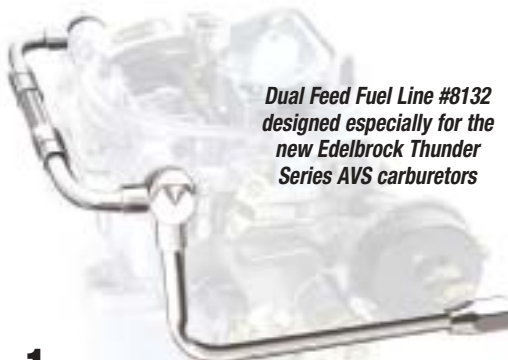
Dual Feed Fuel Line #8132 designed especially for the new Edelbrock Thunder Series AVS carburetors