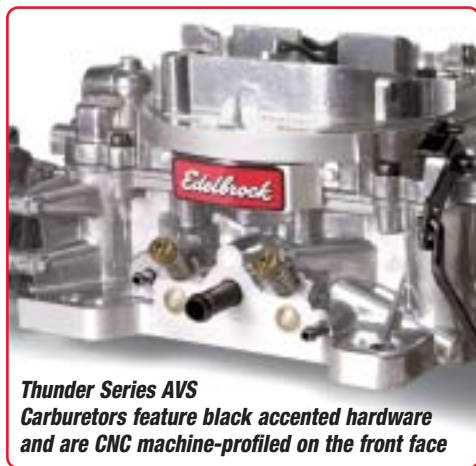
Thunder Series AVS Carburetors feature black accented hardware and are CNC machine-profiled on the front face

Dual fuel inlets are available if desired for total flexibility in fuel system plumbing (shipped with left side plugged)