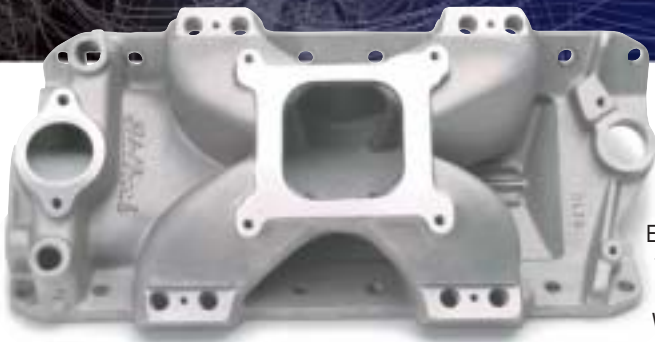
Victor EFI Manifold #29785