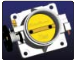
3-D computer image of Throttle Body #3811