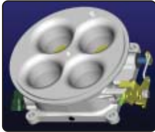
3-D computer image of Universal Throttle Body #3879